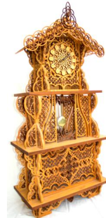
Montana Ridge Clock (#WW-0237) Size: 24" Wide x 11 3/8" Deep x 52" Tall Movement: 7 7/8" or 8" Bezel & Quartz Movement Description: This is a large clock that is advanced. Detailed fretwork with several contrasting overlays. Price: $35.00