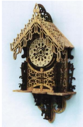
Delucca Clock (#WW-0227) Size: 4 3/4" Deep x 9 3/4" Wide x 18 1/2" Tall Movement: Quartz Movement and WW 173-8 or 4 3/4" Bezel or Insert Description: Medium level Wall Clock with delicate fretwork. Designed to celebrate Anthony and Freda Deluca's 50th Wedding Anniversary. Price: $13.00