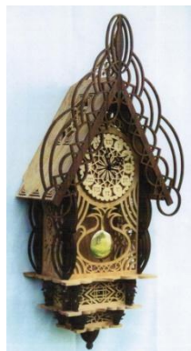
Wesley Clock (#WW-0224) Size: 14" Wide x 7" Deep x 29 1/2" Tall Movement: Quartz Movement & #WW175-8 Face Description: Medium Level Clock with a wall design and a Mantle design. Wall Clock includes two of small boxes. Price: $20.00