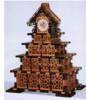
Mustard & Grape Jelly Clock (#WW-0215) Size: 26 1/2" Wide x 18 1/2" Deep x 33 1/2" Tall Movement: 4 1/2" or smaller Bezel or #WW 173-4 Face and Quartz Movement or Clock Insert. Description: A little more challenging Clock that is made up of 4 boxes that are projects by themselves also several brackets. Price: $25.00